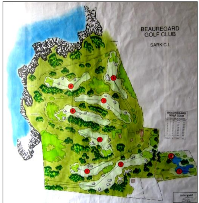
The Beauregard Golf Course as approved in 2000 by the Development Committee chaired by the late Seigneur, Michael Beaumont.

There is nothing new in the concept of a golf course for Sark. In 1967 the Island of Sark com-